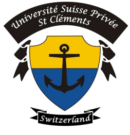
Doctor of Business Management