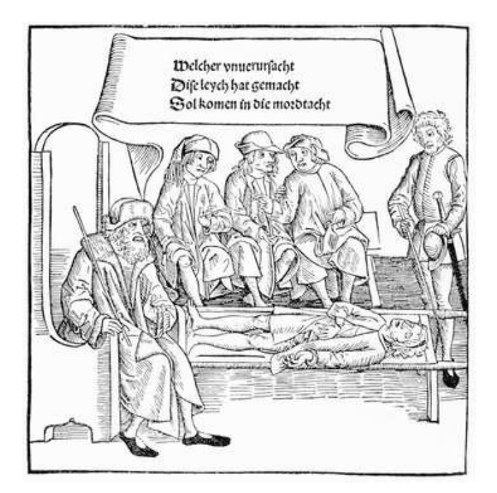
Fig.1 Wood carving from the Constitutio Bambergensis (German penal code as version of 1580), the judge and his jurors look upon a corps. Written above: He who caused this dead body shall suffer proscription for murder .